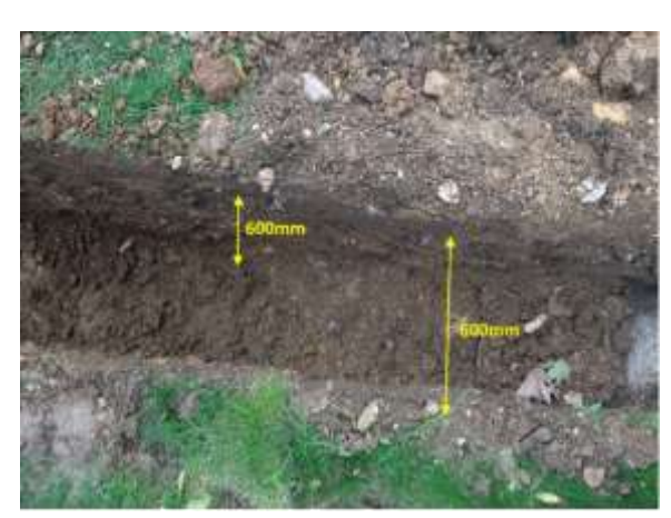
Trench for new service