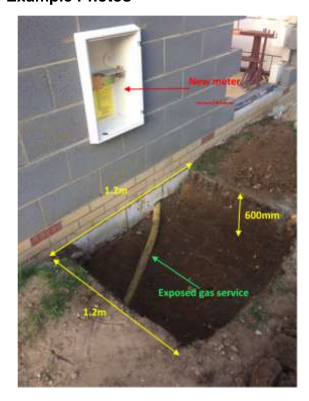
Excavation at service pipe