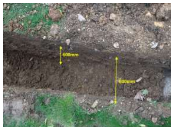
Trench for new service