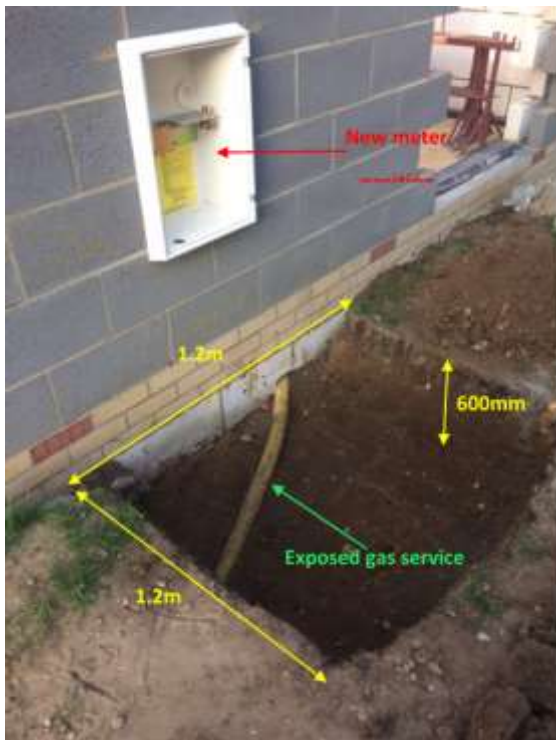
Excavation at service pipe